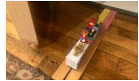
A TRUCK CARRYING PRESENTS TO WAREHOUSE