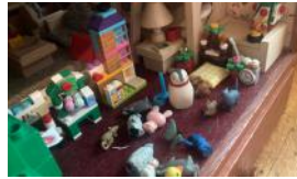
CHILDREN'S SECTION PARTY IN THE DOLLHOUSE