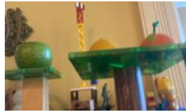
AN ORANGE AND LEMON TREE IN BINGO