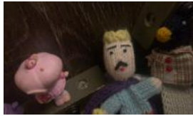
EMPEROR BLUE EYES AND VICE EMPEROR KING